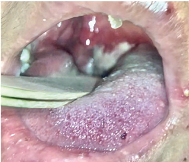
Fig. 2. Vesiculo-pustular perioral lesions.

On neurological examination, complete facial paralysis was apparent, facial function was rated V on the House-Brackman Classification (Fig. 5).